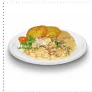
Zurich-style Geschnetzeltes (sliced veal in a cream sauce) with Röstli*