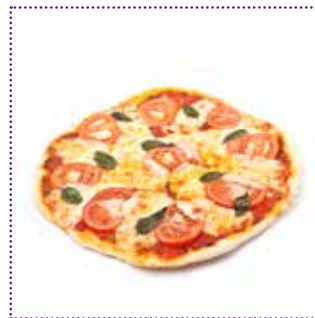
Pizza Margherita (approx. 420g)