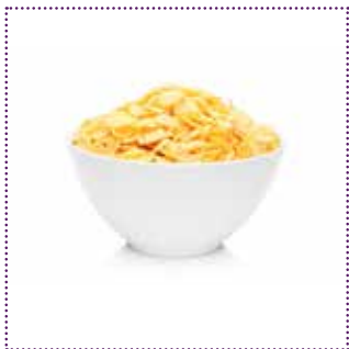
1 bowl of corn flakes with 2dl milk (approx. 240g)