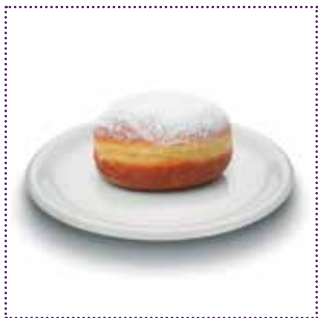
1 doughnut (approx. 60g)