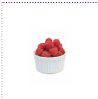
1 bowl of raspberries (approx. 80g)