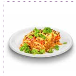
1 plate of meat lasagne (approx. 470g)